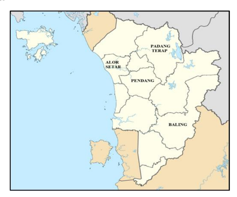
Figure 1. Study Location