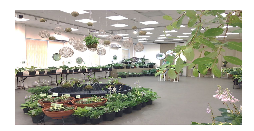
Figure 2. Hosta exhibition, 2021

scientific data on the achievements of selection and the dynamics of exhibiting "from species to variety" (begonias, succulents, maples, etc.). The third stage of the exhibition was the organization of exhibitions based on the ecological principle for scientific and educational purposes, with an emphasis on general ecological knowledge (epiphytes, succulents). At the fourth stage, on the basis of the previous blocks, topics were developed for various social groups and exhibitions were created in order to expand naturalistic erudition (plant metamorphoses, textile plants, invasive plants, etc.).