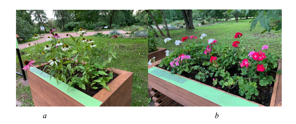
Figure 5. a, b – Options for exhibiting plants in the Garden for challenged people, 2021

In the botanical garden, there is an opportunity to make a synthesis of perennial and annual crops in flower beds or create flower beds or specialized expositions of spicy aromatic plants or plants with a strong pleasant smell of Hyssopus L., Origanum L., Lavandula L., Mentha L., Melissa L., Rosmarinus L., Thymus L. and others. This direction is widely used, including in the Garden for challenged people, where education is possible due to special beds and accompanying information in Braille (Figure 05, a, b).