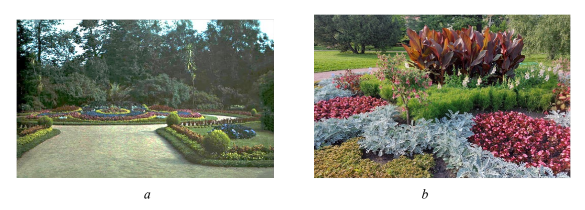
Figure 4. a – Photo of the central flower bed of the Imperial Botanical Garden, 1913; b – Photo of the central flower bed of Peter the Great Botanical Garden, 2020

In the botanical garden, there is an opportunity to make a synthesis of perennial and annual crops in flower beds or create flower beds or specialized expositions of spicy aromatic plants or plants with a strong pleasant smell of Hyssopus L., Origanum L., Lavandula L., Mentha L., Melissa L., Rosmarinus L., Thymus L. and others. This direction is widely used, including in the Garden for challenged people, where education is possible due to special beds and accompanying information in Braille (Figure 05, a, b).