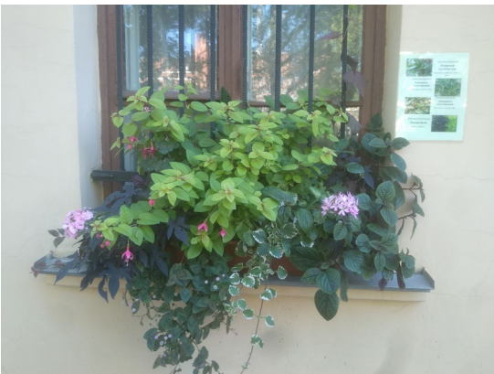
Figure 6. Examples of balcony boxes with information on BALKONIA project