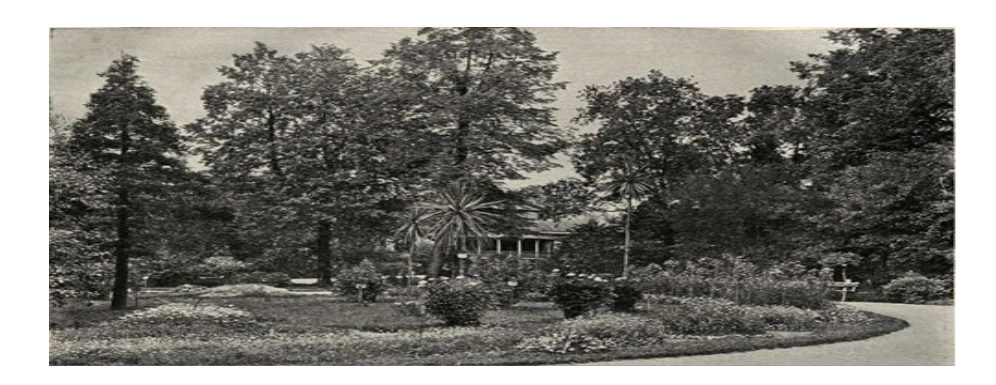
Figure 3. Central flower bed of the Imperial Botanical Garden, 1905 (a photo in "Illustrated guide to the Imperial Botanical Garden", 1905)

Roth, Fuchsia L., Begonia L., Cineraria L., Coleus Lour standard culture Fuchsia L. is used (Figure 04, b).