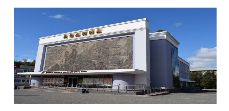
Figure 3. The building of the cinema after restoration (Prospekt m., 2019)

But there is also something that the Krasnoyarsk muralists brought to the technique of execution. So, for example, the most recognizable mosaic panel "Motherland" on the facade of the cinema "Rodina" (the House of Friendship of Peoples after the restoration of the building) on Krasnoyarsky Rabochiy Avenue is made not from smalt, but from Yenisei pebbles. The author of this panel (Figure 3) Evgeny Kobytev (Figure 4). The plot of this work is no less interesting: the mother raises the child, showing him his homeland. And since the action takes place against the backdrop of Pillars, we can assume that she is showing her child exactly Krasnoyarsk.