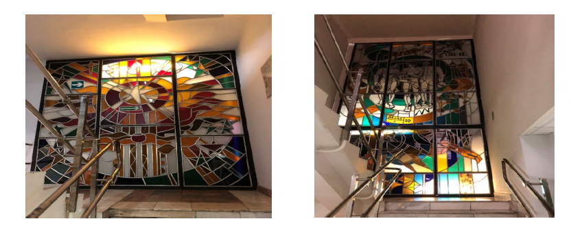
Figure 8. Stained glass windows in the House of Science and Technology

Comparing these three techniques of monumental fine art with classical church works, we can conclude that Soviet muralists kept in touch with the classical school and primary sources, but in no case copied them, but developed and brought something new, consistent with the spirit time. And although the works of monumentalists differed from the previously existing church works, in general they met the same goals and served as a kind of spiritual and moral guidelines.