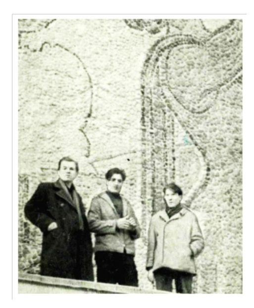
Figure 4. Mosaic work. (Kraskompas, 2021)

2) Fresco. Fresco is more common than mosaic. In Krasnoyarsk, for example, you can see original frescoes from 1951 (Figure 5) that adorn the ceilings of the river station. The theme of these frescoes are the sights of the city: natural and urban motifs. Or later frescoes on the facades of five-story buildings, for example, on the right bank of Krasnoyarsk (Figure 6).