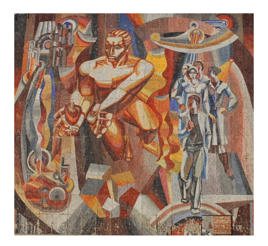
Figure 2. Mosaic " The Biolife"