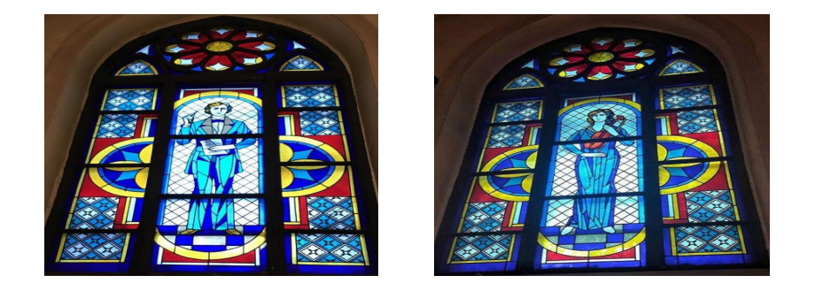
Figure 7. Stained glass windows in the Organ Hall (The history of architecture, 2021)

Much more interesting are the stained-glass windows located in the house of science and technology. Made in the classical technique, they are a vivid example of Soviet modernism of the late 70s. The theme is quite consistent with the location: space, science, the future (Figure 8).