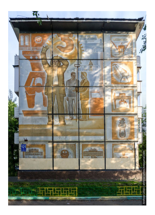
Figure 6. Fresco on the facade of a five-story building