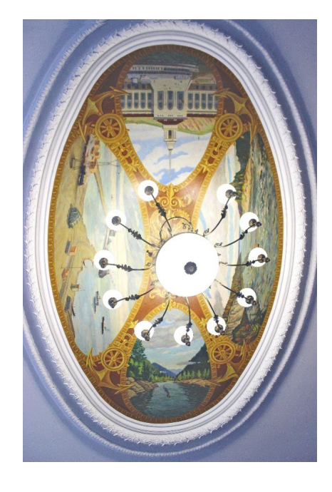
Figure 5. Frescoes of the river station (after restoration)

decorative elements disappeared and the fresco moved from the ceilings to the outer walls, the theme and message of the work itself changed. The greatest attention is now paid to scenes from everyday life, which glorify the feat of the worker. It is important to note that in later frescoes, a person is never depicted alone. He is always among colleagues, family members or other members of society. In this case (Figure 6) these are scenes from the daily life of a shipyard.