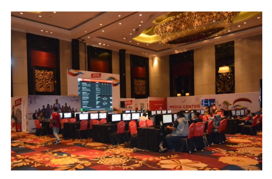
Figure 2. Journal Room of the Main Media Center PON XIX

Intermediary MC are placed in two locations with the most contested sporting events, namely in the city of Bandung, precisely at the Gelora Bandung Lautan Api Stadium and Bandung Regency at the Jalak Harupat Stadium Complex. This Intermediate MC collects reports and data, from the MC in each sport held in the two cities or districts with the facilities provided are journalists' workspaces and press conference rooms. Both have medium specifications, sizes, and dimensions, or smaller than the Main MC but larger than the sports MC and the National Sports Week MC. The third is the MC of the National Sports Week, which is a MC in 14 cities and regencies where the National Sports Week is held outside the City and Regency Bandung, such as Cimahi City, Sumedang Regency, West Bandung Regency, Cirebon City, Indramayu Regency, Ciamis Regency, City Tasikmalaya, West Bandung Regency, Subang, Sukabumi Regency, Karawang Regency, Bekasi Regency, Bekasi City, Bogor Regency, and Pangandaran Regency. In this MC there is also a special room for the central MC at the National Sports Week level. The rest is MCs at sports locations with the main facilities available are journalists' offices and press conference rooms. Both have specifications, sizes, and dimensions below Main MC and Medium MC.