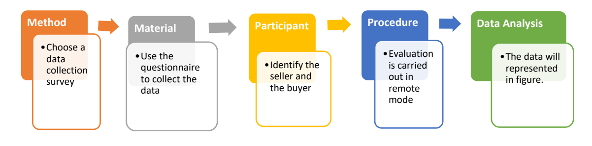
Figure 3. Steps in the evaluation method