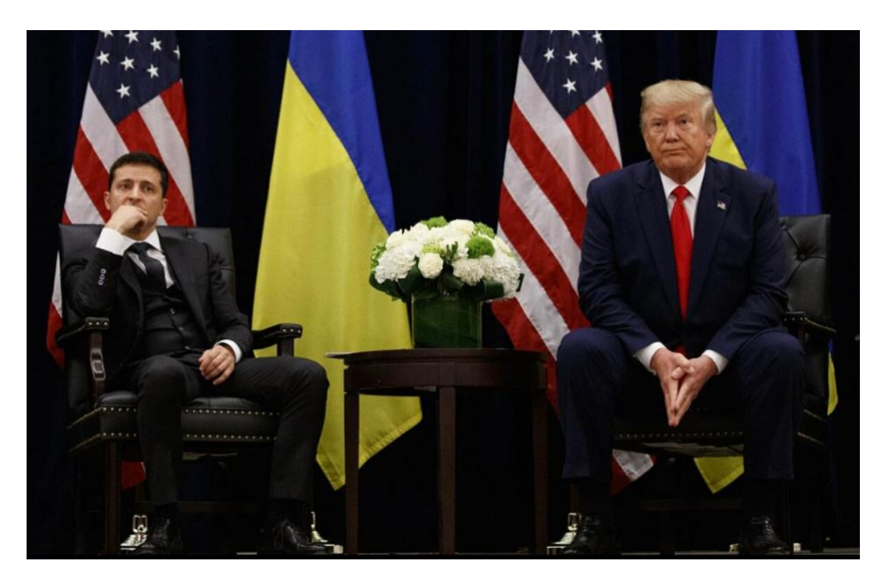
Figure 2. Donald Trump and Vladimir Zelensky (2019)

In modern public administration the recent meeting of Donald Trump and Vladimir Zelensky (see Figure 2), which was actively analyzed in the media, can be a similar example.