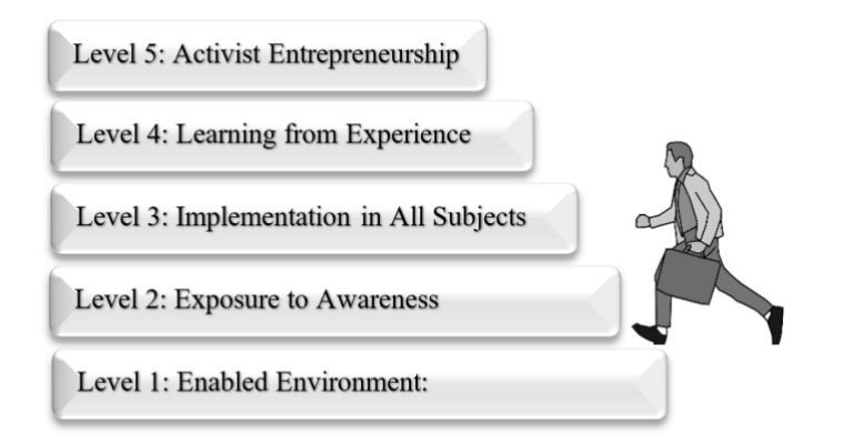
Figure 02 below illustrates the five-level practical model for promoting ACAP to help teachers in all disciplines to understand how activist teachers should use this practical and useful model inside and outside classrooms.