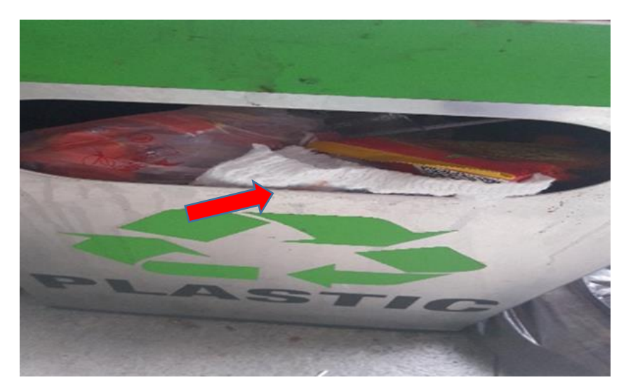
Figure 02. Bin for plastic waste

The design for dustbin in Figure 02 is for plastic waste, however, obviously we can see diaper (red arrow) in that bin. This is one of the examples that waste was not segregate accordingly. This bin is located in one of the shopping malls in Pahang.