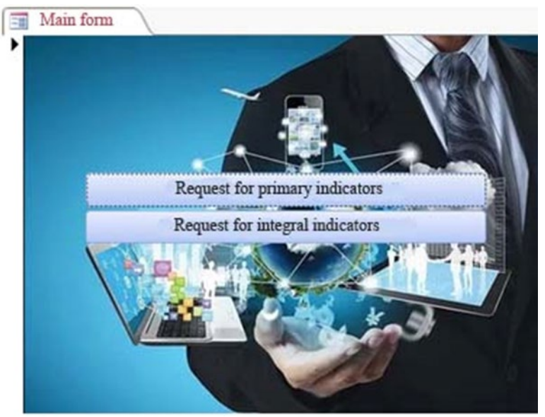
Figure 08. The main form of the database "Cluster Policy Monitoring" (compiled by the authors)

Next, we move on to creating the main form, which will provide quick access to requests (Figure 8).