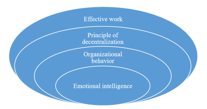
Figure 01. Components of modern management

The principle of decentralized management contains these two components. The first component is organizational behavior (Bersel, 2017; Gusinskaya, 2018; Saunders, 2019). The second is emotional intelligence (Goleman & Boyatsis, 2017; Hasson, 2018; McKee, 2016). It is important that employees are motivated to perform their work, cooperate with others, help each other, and be responsible for their actions. Figure 1 shows the components of modern management, based on the above information.