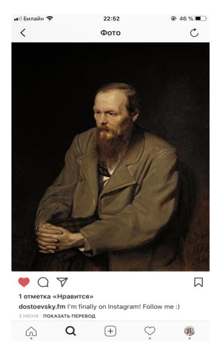
Figure 01. Dostoevsky's Instagram page as presented during the workshop (MCU workshop presentation, June 2018, 2019)

• Dostoevsky's biography presented in the form of the interactive chart (Figure 02 below).