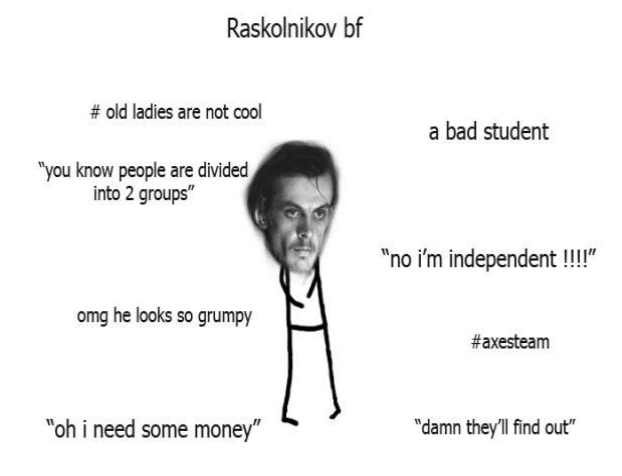
Figure 03. Raskolnikov's meme as created during the workshop in June, 2018