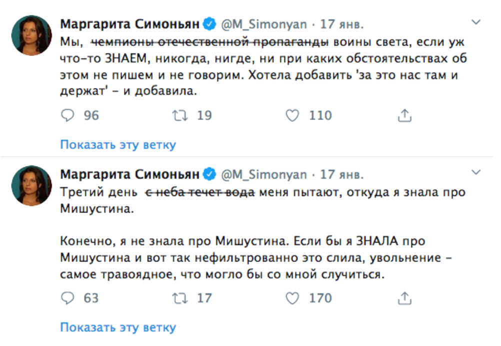
Figure 05. M. Simonyan's post on Twitter

The use of a special font characterizes M. Simonyan as a principled and bold journalist (Figure 05).