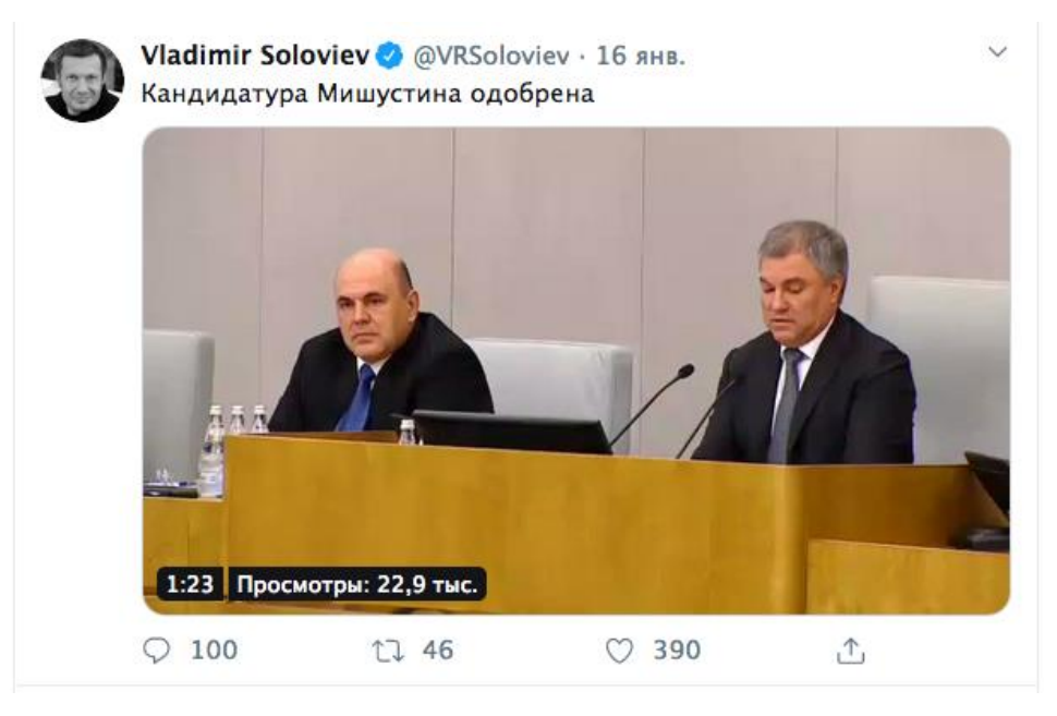
Figure 04. V. Soloviev's post on Twitter

Vladimir Solovyov also uses hyperlinks as a "side view": for example, the opinion of the "main Norwegian tax specialist" about Mishustin is shown. Thus, Soloviev shows an objective picture of what is happening.