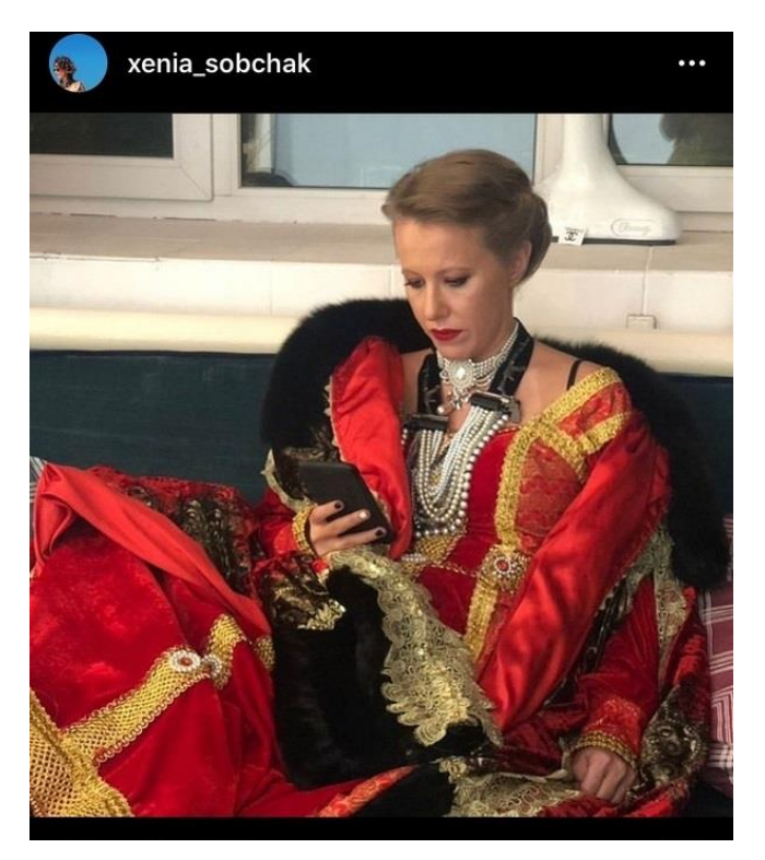
Figure 02. Ksenia Sobchak's Instagram post