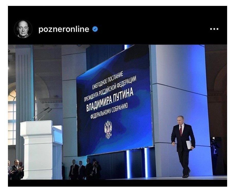
Figure 01. Hyperlink from Vladimir Pozner's Facebook account to a resource https://pozneronline.ru/

journalists with Pozner in traditional media (magazines, newspapers, TV shows), as well as reposts of articles and posts of other Facebook users interesting to him;