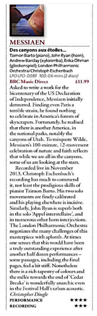
Figure 02. The example of a review from BBC Music Magazine

The scheme coincides with the graphic design of the reviews on BBC Music Magazine pages (Figure 2), where the parameters of evaluation are indicated. The parameters Performance and Recording reveal the addressee of the critical message.