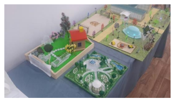
Figure 01. Competition of architectural projects "The City of My Dreams", Magnitogorsk, 2019

Today, the subject environment of human life, work and leisure has become one of the most important areas of the designer's activity (Chernyshova et al., 2017). Therefore, schooling must include art design, technical aesthetics and its basis – technical graphics. Technical graphics are the science of how scientific information is transmitted. It examines all types of images, the basics of visual perception of the form and its image on the plane with parallel rays – orthogonal drawing and axonometry; conical rays – perspective. High school students should understand the tasks and essence of graphic activity, as well as have some practical skills, since in his work the designer creates things, environmental objects, interiors (sociotechnical environment), the exterior of the house, etc. Teaching the basics of design is carried out in optional classes on the "Technical schedule" starting from the 9th, 10th and 11th grades. Already in high school, students participate in city competitions of architectural projects "City of my dreams" in 2019 Magnitogorsk (Figure 1), the All-Russian contest for high-speed 3-d modeling and visualization "3-d day, 3-d night" in Saratov »Both as a team and individually, defending their research projects and design projects.