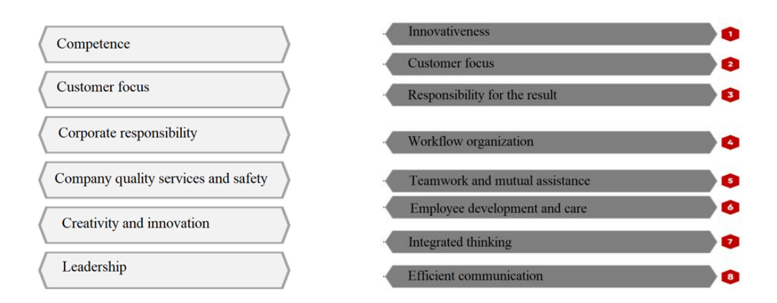
Figure 01. '5C + L' Model (2010-19)

JSC Russian Railways in its activities is focused not only on the implementation of external corporate social responsibility, but also on the internal one (Petukhov & Gorshkov, 2019; Samusev & Kalinova, 2018). The competency-based approach implemented in JSC Russian Railways allows promoting the corporate values of the company from the mission to the levels of posts, job competencies, subcompetencies and their indicators implemented in the personnel management system through this model (Kolbasova & Kutuzova, 2017; Malakhova, 2016). Competency indicators are used in the personnel selection, motivation, assessment, certification, training in JSC Russian Railways (Kutepova, 2018; Matsas et al., 2019; Staver & Yakimova, 2017). Considering the updated model of corporate competencies of JSC Russian Railways defined in the 'Regulation on the model of corporate competencies in JSC Russian Railways' approved by the decision of the Board of JSC Russian Railways dated May 13, 2019 No. 25, one might note an increase in the emphasis on internal corporate social responsibility (see Figure 01 and Figure 02).