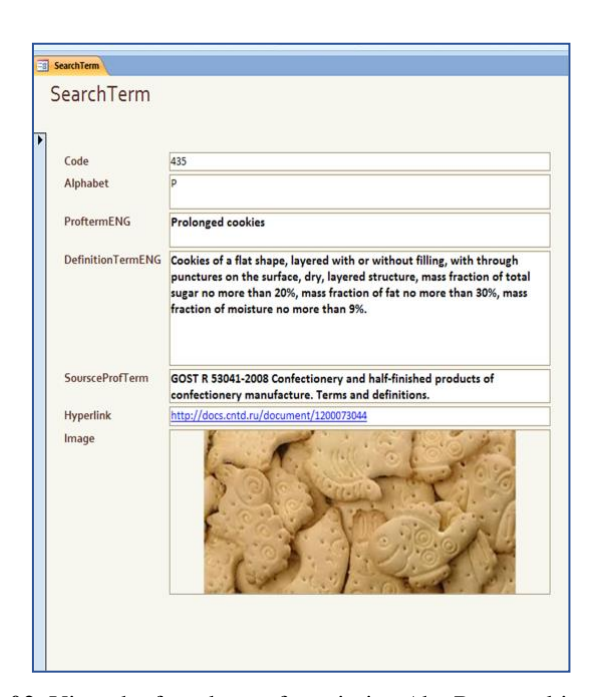
Figure 02. View the found term for printing (the Report object opens)

Obtaining complete information on a specific term is possible in three ways: 1) opening the Main form in the "Form" mode allows the user to see on the screen and print full information on a specific term; 2) by filling in the "Search by term" dialog box that appears when you click the button with the corresponding name in the Main form. As a result, we obtain information on the desired term; 3) by pressing the button "Find and print the term" in the "Main table" (Figure 2).