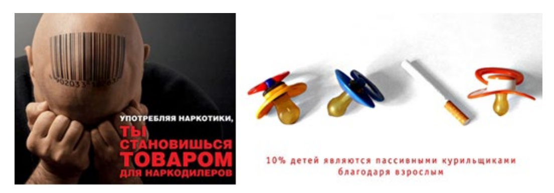
Figure 05. How the visual components functions in an advert

The visual part of an advert is closely linked to the text and is in many ways inseparable. The picture sometimes won't work without the slogan; the slogan will be incomprehensible without the graphical component.