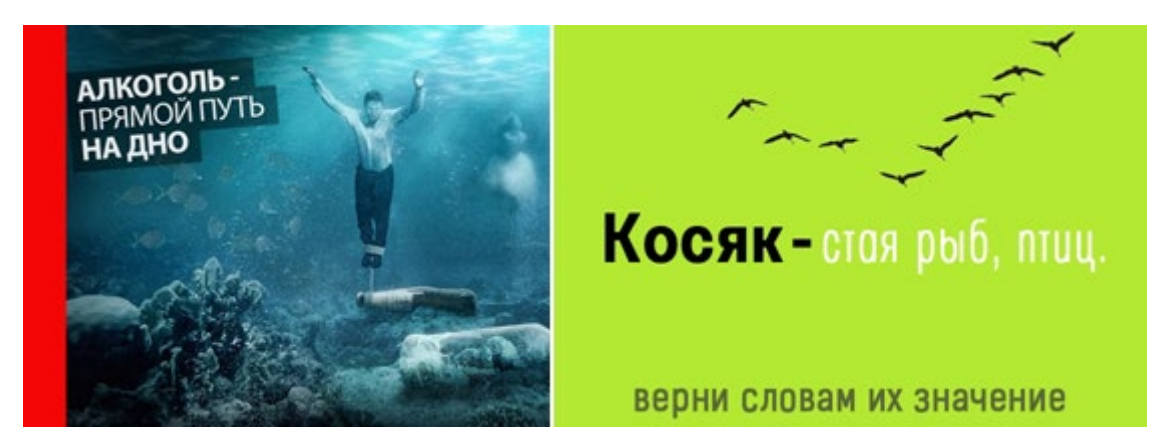
Figure 02. Anti-alcohol social adverts with puns

Some more examples of double meaning are presented below.