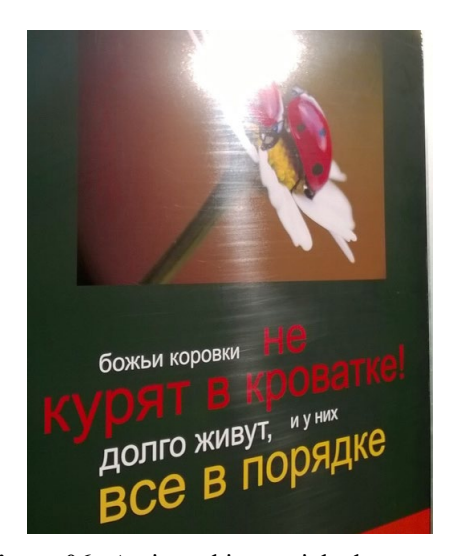
Figure 06. Anti-smoking social advert

As shown in figure .06, the picture can be just a colourful addition to the verbal component.