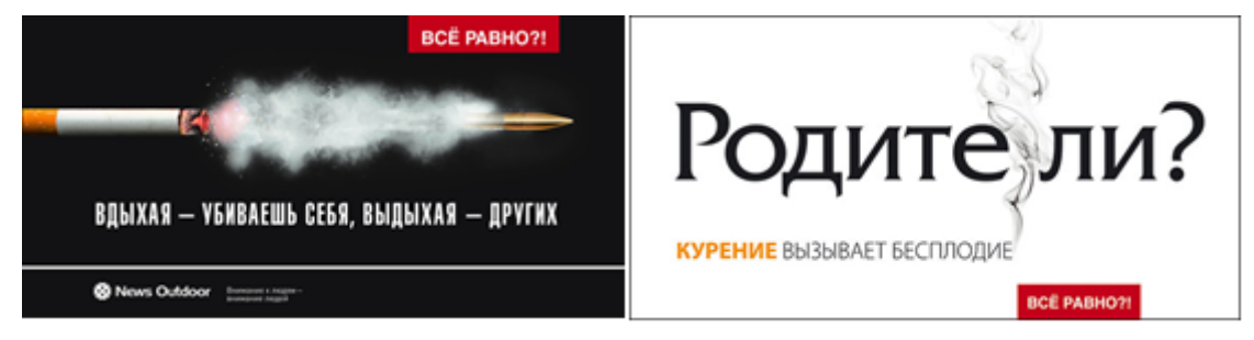
Figure 01. Anti-smoking social adverts

Intimidation strategy, which is based on fear, is most often recognised with the concepts of safety, war, bad habits, violence and some others (Sotnikova, 2018). In the current research, this strategy can be observed in more than 75% of the research material, which proves the existing idea that bad habits such as smoking and drug and alcohol addiction cannot be erased peacefully but require threat, real or imaginary.