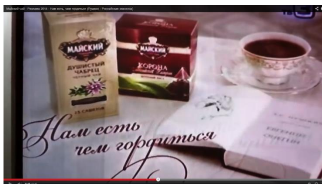
Figure 01. “Eugene Onegin” in “Maisky” tea advertisement (commercial)

This idea can be fully transferred to the use of classical literature in advertisement (Fig.01).