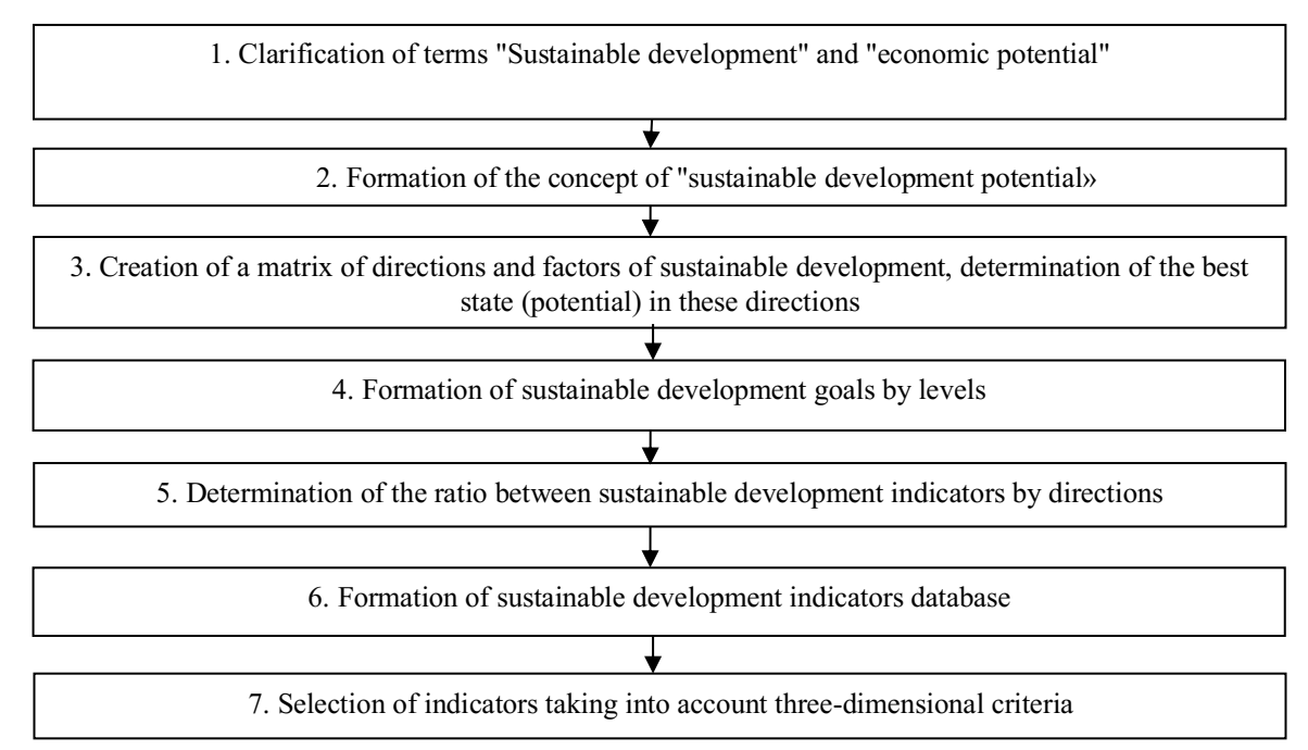
Figure 01. Scheme of indicators formation for sustainable development assessment

Sustainable development is not only a stable development that meets needs of the present without compromising the ability of future generations and their own needs, but it is also a development that takes into account all the production potential, the availability of production factors and its defining resources.