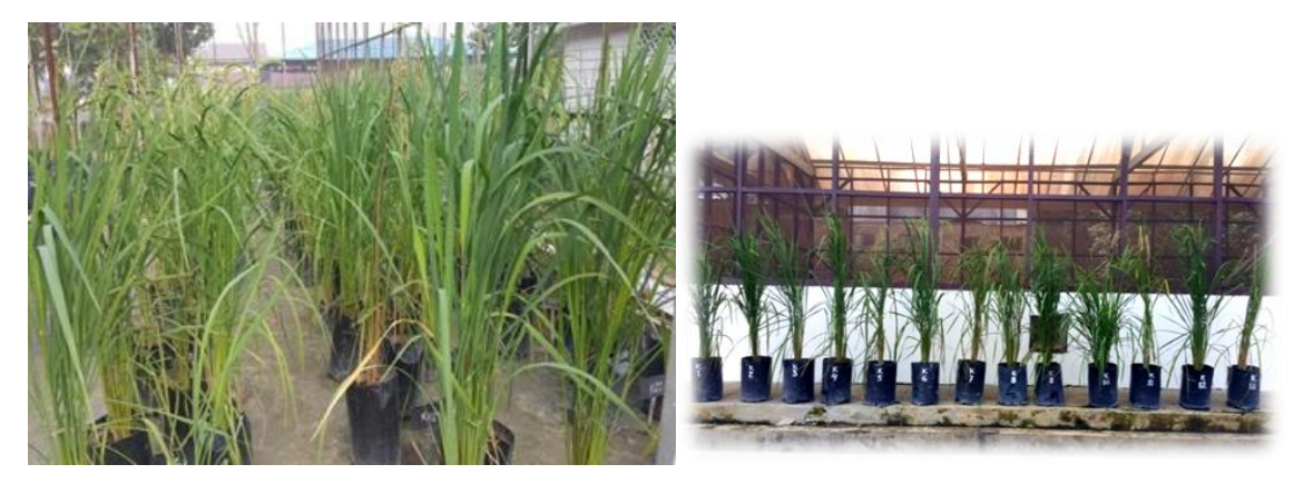
Figure 02. The raising of 14 cultivars of Upland Red Rice North Sumatra

The cultivars that have been collected from the farmers' fields are collected and stored in cold storage, and some are planted for consolidation and rejuvenation by ex situ or in situ . For rejuvenation of acquired rice cultivars planted in experimental garden of agriculture faculty UISU Medan (as many as 14 cultivars). Furthermore, identification is done. The data taken are morphological character and production component. Data observed is still limited to the initial character include, plant height, number of productive tillers, panicle length, flowering age, 1000 grain, grain shape, and grain color