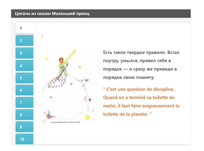
Figure 05. Interactivity "Quotes from the fairy tale The Little Prince"

An interesting section of the resource is a selection of famous quotations from The Little Prince . Students are invited to choose one of the quotes and offer a personal comment (Fig 5).