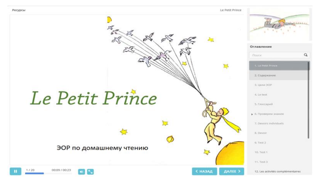
Figure 01. Structure of the electronic resource for home reading

The resource under review was developed to support French language classes based on The Little Prince , Antoine de Saint-Exupery's philosophical tale (Figure 1). It is precisely on the basis of an electronic resource that a competent professional approach to this story is possible , which stands out as a unique phenomenon in world culture and, with its moral and cultural message, represents an important value reference point in the intercultural educational environment (Tareva, 2011; Zheltukhina et al., 2016). This educational resource for home reading provides ample opportunities to present the authentic text with explanations, visual representations, audio and video support materials and a variety of interactive activities. The literary work underlying the resource sets a specific sequence to cover the material using information that contains cultural and country-specific content.