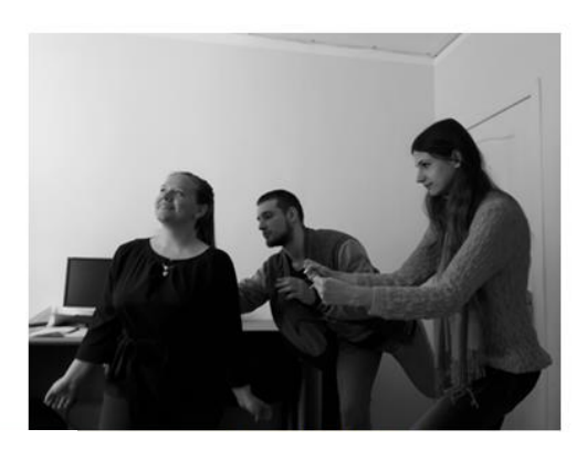
Figure 03. Risk