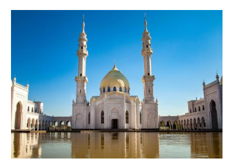
Figure 02. The White Mosque

The "Island-town Sviyazhsk" has a rich history (Figure 03). Originally it was built by Ivan the Terrible to support Russian army in conquering Kazan – the capital of Kazan Khanate in 1552. On the town's territory there is a huge number of religious Orthodox buildings: Assumption Monastery, holding the relics of St. Herman, The Assumption Cathedral, The Trinity Church and many others.