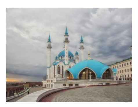
Figure 04. The Kol Sharif Mosque

Not far from Kazan Kremlin, pilgrims are especially attracted to the place where the Icon of the Mother of God of Kazan was found. The very same image is kept in the Holy Cross Church (Figure 05) together with the piece of the belt of the Blessed Virgin. The miraculous list of the icon has been and still is believed to be the defendant of Russia. The place is believed to be one of the places where The Holy Virgin Revealed Herself pointing to the place where the Icon was buried.