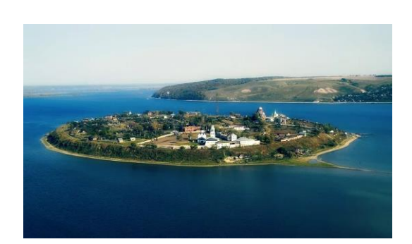
Figure 03. The Island-town Sviyazhsk

The "Island-town Sviyazhsk" has a rich history (Figure 03). Originally it was built by Ivan the Terrible to support Russian army in conquering Kazan – the capital of Kazan Khanate in 1552. On the town's territory there is a huge number of religious Orthodox buildings: Assumption Monastery, holding the relics of St. Herman, The Assumption Cathedral, The Trinity Church and many others.