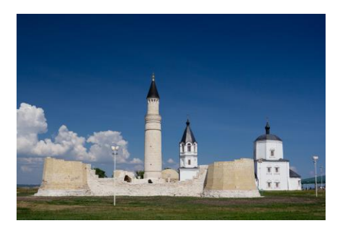
Figure 01. Ancient city Bulgar

a religious and historical center, but also to breathe new life into a small village, creating here one of the largest religious tourist routes.