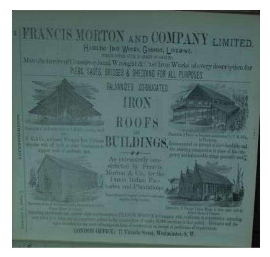
Figure 01. Francis Morton and Company Limited advertisement

All three clauses involve with the material process; a transitivity process which describes the process of doing (Simpson & Mayr, 2010). The analysis of this transitivity process is as Table 01 below: