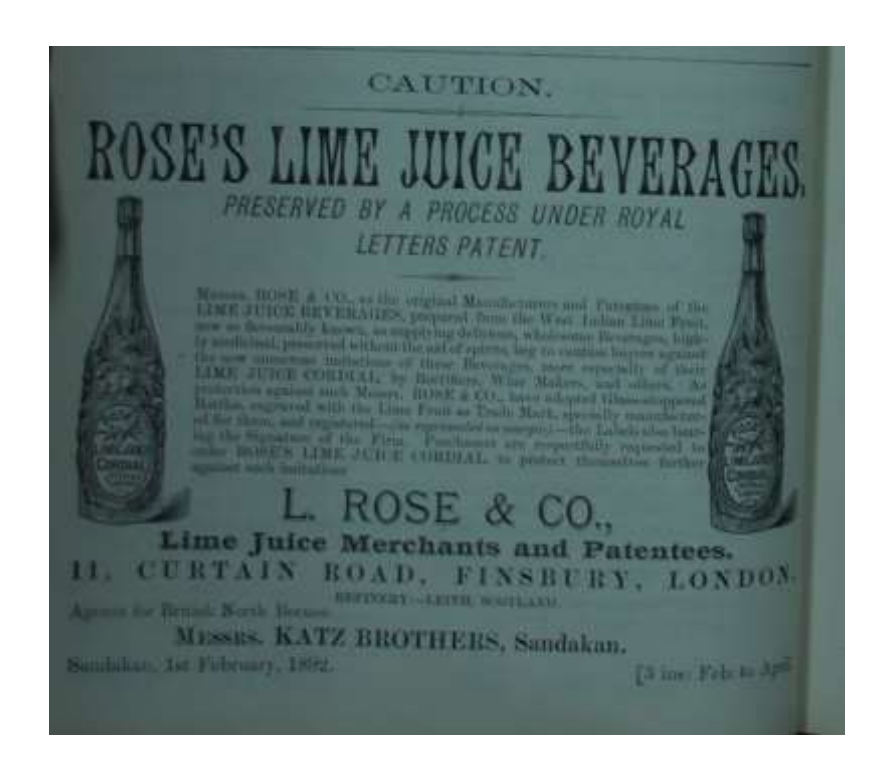
Figure 03. L. Rose Co. advertisement

4.(ROSE & CO.,) registered [- (as represented on margin) -] the Labels also bearing the Signature of the Firm