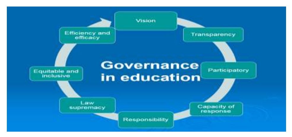
Figure 02. Governance in education public policies.

The philosophy of governance in education should be the frame for the education public policy. Meaning the capacity to anticipate the future problems, including the critical premises based on data, information and tendencies and the capacity to design policies that anticipates the change - VISION. Actions, decisions and processes to take decisions that are open and known by all stakeholders, including the civil society – TRANSPARENCY. The capacity and flexibility to rapidly answer to the society evolution and changes, considering the civil society expectancy in order to identify the general public concern, as well as the capacity to analyse the own activity in critical spirit – REPONSE. Actions and decisions are correlated to the clear stated and shared by all parts objectives – RESPONSABILITY. The capacity to implement measures that guarantee the results satisfy the intentions the education public policies were elaborated and implemented for, quality at the lowest cost and so on – EFFICIENCY AND EFICACY. And of course, LAW SUPREMACY – equal, transparent law Figure 02. (Hoffmann, 2011).