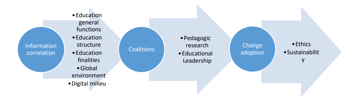
Figure 03. The succession of the approach in education changes. Source: author

Starting from the generalized perception that the automatics and technology will reduce the number of jobs, President of the World Bank Group (World Development Report, 2019) declares implacably that the report assumes the primacy of human capital without which the technology and automatics cannot evolve: "Many jobs today, and many more in the near future, will require specific skills, a combination of technological know-how, problem-solving, and critical thinking as well as soft skills such as perseverance, collaboration, and empathy". The success key is lifelong learning. "Innovation will continue to accelerate, but developing countries will need to take rapid action to ensure they can compete in the economy of the