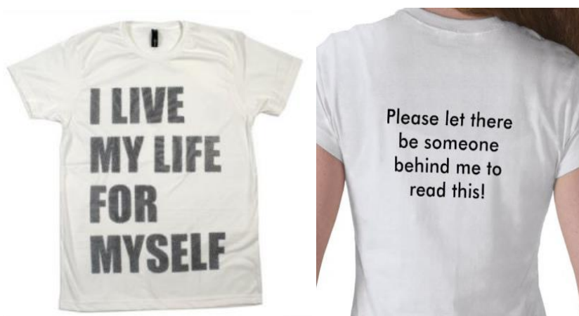
Figure 01. Photos of T-shirts with inscriptions

The linguistic and structural analysis of the English T-shirt inscriptions allows us to assume that there are a number of peculiarities in their representation. Among them we have noticed the zigzag structure of sentences, elliptical constructions, language games, intertextuality, absence of subject, changes in the word order, substitution of some parts of speech and whole sentences, the predominance of the imperative constructions, etc. T-shirt inscriptions are also rich in acronyms and other abbreviations. In addition, they can be brightly highlighted graphically, accompanied by a variety of prints, unusual colours (Figure 01). Inscriptions possess genre syncretism and perform a number of functions: advertising and expressive, representative, nominative and informative, text-forming, aesthetic and others. T-shirts, whether you like it or not, speak for themselves about you or your views. So this research is devoted to the study of the T-shirt inscriptions as an example of a new media type.