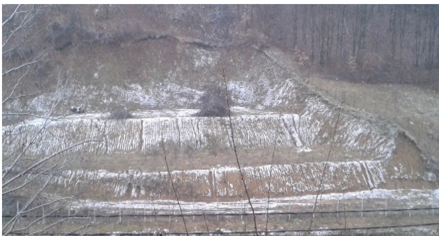
Figure 04. Anthropic terraces landscape