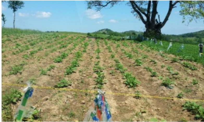
Figure 02. The landscape of fodder beet culture