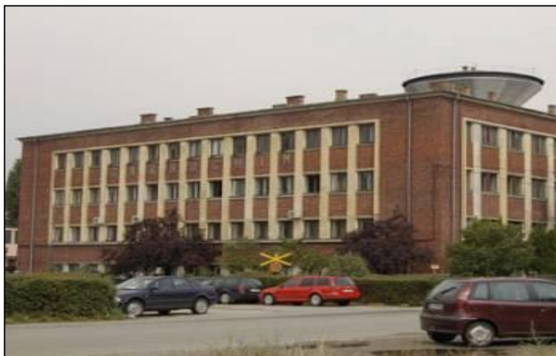
Figure 06. Industrial Landscape The “Carbochim” Industrial Complex in Cluj-Napoca

Analysing the competence level. Based on the evaluation of the works with this tool, Table 2 shows that the students' level of competence to analyse geographic landscapes is at a higher level of competence in one case ( m = 4.5 ) and at medium competence level ( m > 2.3 ) in the other cases. These results indicate that students used the information and directions from the university course on the Geography of Landscape and on other subjects, carefully studied the recommended references, and met the given requirements, all of these contributing to their case study. The successful achievement of these projects is the result of an efficient didactic communication (Cuc, 2013b, 2014) and the capitalization of all the learning styles of the students in order to develop their professional competences (Cuc, 2013b; Chiş & Grec, 2017).