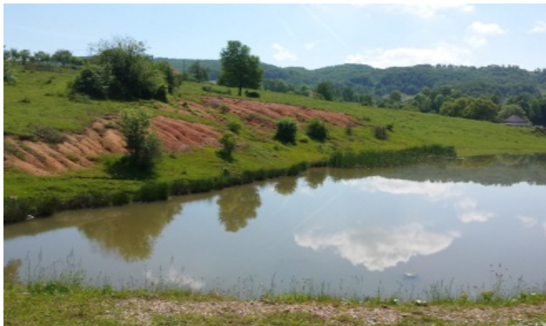
Figure 03. Anthropic lake landscape (Zece Hotare)