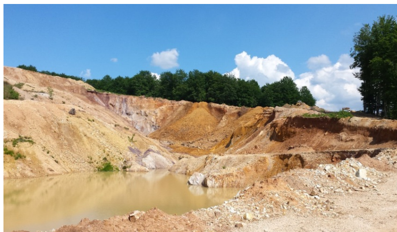
Figure 01. The quarry landscape culture (Zece Hotare)