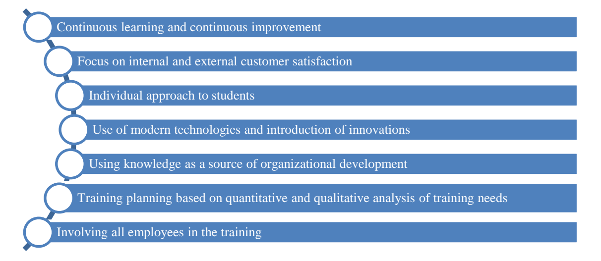
Figure 02. Policies principles in the field of personnel training a number of large machine-building enterprises in Samara

The most important stage in the system of corporate training is to determine the need for training and its planning – this is one of the links to organize the process, which quality depends on the effectiveness of the subsequent employees' activities, company departments and, most importantly, the effectiveness of the corporate training system as a whole. It should be noted that the discrepancy between the goals of employees' training and the company development needs is a serious risk, reducing the expected effect from human resources training. Based on a precise quality definition (clear goals formation; what to teach, what skills to develop) and the quantity need (how many employees and what categories of personnel to train) for training, the business environment analysis, thorough the assessment of the company workforce potential, designing thematic, calendar and functional plans for training and personnel development, can achieve a significant reduction in such risks. Creating a system to assess the impact of training on the results of company production activities will not only assess its effectiveness, but also make the necessary adjustments in time.