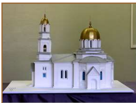
Figure 02. A model of the Church of the Holy Trinity.

The final discussion of the research work and the implementation of the model showed that the students were unanimous in their understanding of the historical and cultural heritage of our country - Russia and the great significance of the “small Motherland”. Through the revival and reconstruction of a small suburban church, great events were reflected, i.e. the loss and acquisition of spiritual, national and artistic values of several generations of people. This is especially important for those who are young and whose values are beginning to shape