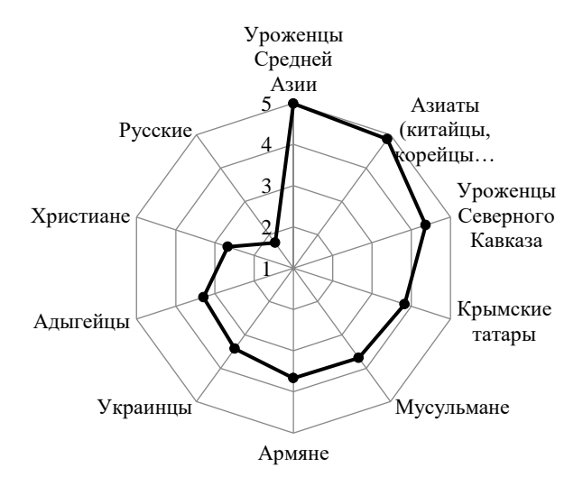
Почасовой стрелке: уроженцы Средней Азии- Central Asia natives, Asians (Chinese, Koreans, North Caucasus natives, Crimean Tatars, Muslims, Armenians, Ukrainians, Adygeis, Christians, Russians. Figure 01. The measurement results on the social distance scale of E. Bogardus (the measurement was made on a scale from 1 - maximum proximity to 9 - maximum distance)

meetings to support for the repatriation of the Circassian diaspora, raise issues of the Circassians genocide, the enlargement of the region and the merger of Kabardin-Bolkaria and Karachay-Cherkessia, etc. It is interesting that according to the questionnaire (n=430) conducted in Krasnodar Territory in May - September 2018, Adygeis who "outstripped" even the Ukrainians are closer for Krasnodar youth among ethnic groups living in the region. Although the occurrence frequency of installations for maximum proximity (readiness to accept as family members) in relation to the Ukrainians is a little more often observed than in relation to the Adygeis. Survey participants demonstrate the greatest distance in relation to natives of Central Asia and Asians (Chinese, Koreans) (Figure 01).