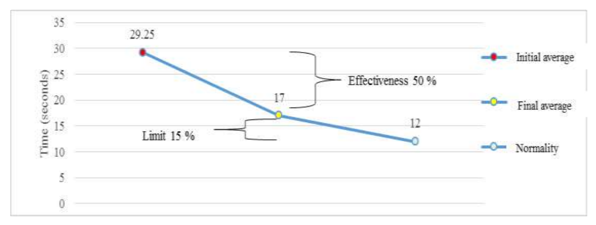
Figure 03. Therapy effectiveness and limit in terms of decrease in the performance time of test tasks