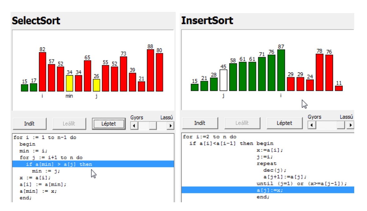
Figure 01. Visualised sorting processes by SelectSort and Insertsort

For deeper analysis of sorting algorithms and discovering of their properties this application was specifically used. Besides visualized graphic model it also contains written algorithmic code. Line cursor shows which part of an algorithm is being currently executed in the source code. It allows a learner to analyse 5 basic sorting algorithms: Simple Sort, Select Sort, Bubble Sort, Insert Sort and Quick Sort. The user can study the source code, compare algorithms between each other, search for differences among them and discover their properties which he can then use for writing his own program codes (Végh, 2016, 2017; Végh & Stoffová, 2016, 2017). The student's task was to at first understand how individual sorting algorithms work, comment source (pseudo)code and verbally describe and express in writing every algorithm based on visualized simulation experiments with a model. His task was also to explicitly express sorting state in defined moment when the sorting animation stopped (so express it in certain values of control variable cycles). Students were also given task to discover informational meaning of sorted object's colour. Objects of sorting were columns of various (random) height. Columns weren't sorted at the beginning.