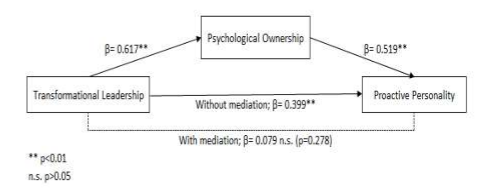
Figure 02. Mediation Model

Indeed, hypotheses 1, 2, 3 and 4 have been accepted.