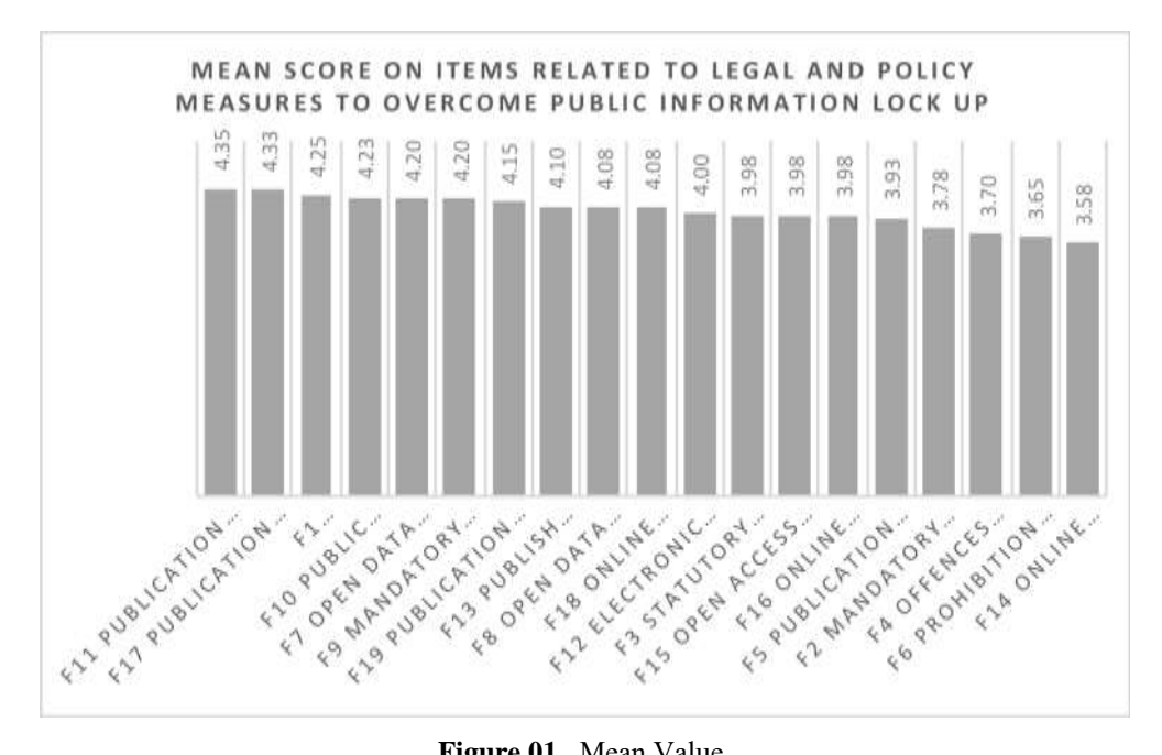
Figure 01. Mean Value

policy measures to overcome public information lock up. The Likert scale used are as follows: 1=Strongly Disagree, 2=Disagree, 3=Not Sure, 4= Agree, 5=Strongly Agree. The summary of the analysis result is as presented in Table(s) and Figure(s).