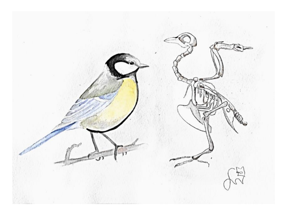
Figure 01. Example of an associate illustration of the discipline "Fundamentals of PR" obtained from one of respondents.

An example of one of the illustrations is shown in Fig. 01 (drawn by the respondent, published with his consent)