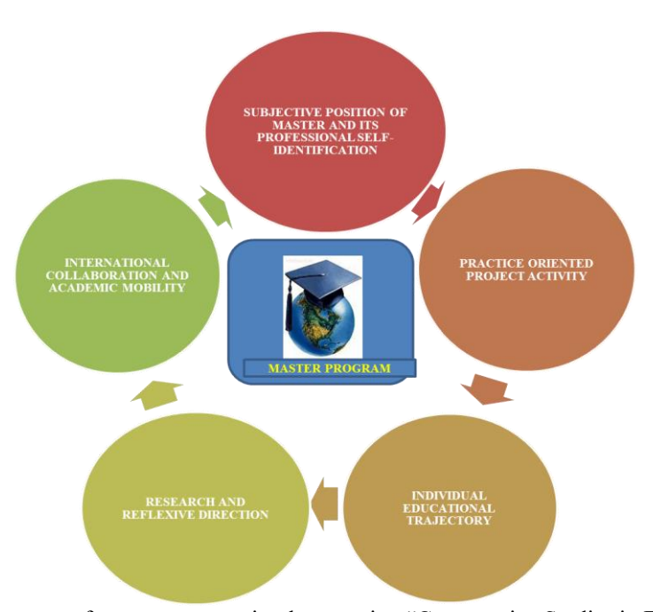
Figure 03. Features of master program implementation "Comparative Studies in Education (Russian-German Studies)"

The following figure (Fig. 03) presents the features of described master program implementation.