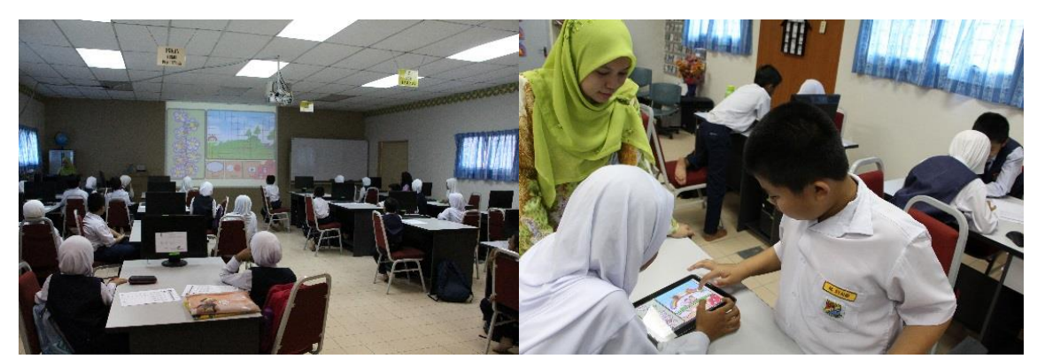
Figure 01. Introduction and tutorial session Figure 02. Digital game design activity in group

Essentially, this study involved both descriptive and interpretative analysis. With both methodological approaches, the researchers were able to obtain a holistic picture of the characteristics of a particular situation, the behaviours of the research participants, and pertinent information during testing. Using the Atlas. Ti. software, the qualitative data were analysed based on the triangulation approach and the typology approach using a thematic analysis. The holistic analysis of the field data helped yield the research findings that were precise and reliable.