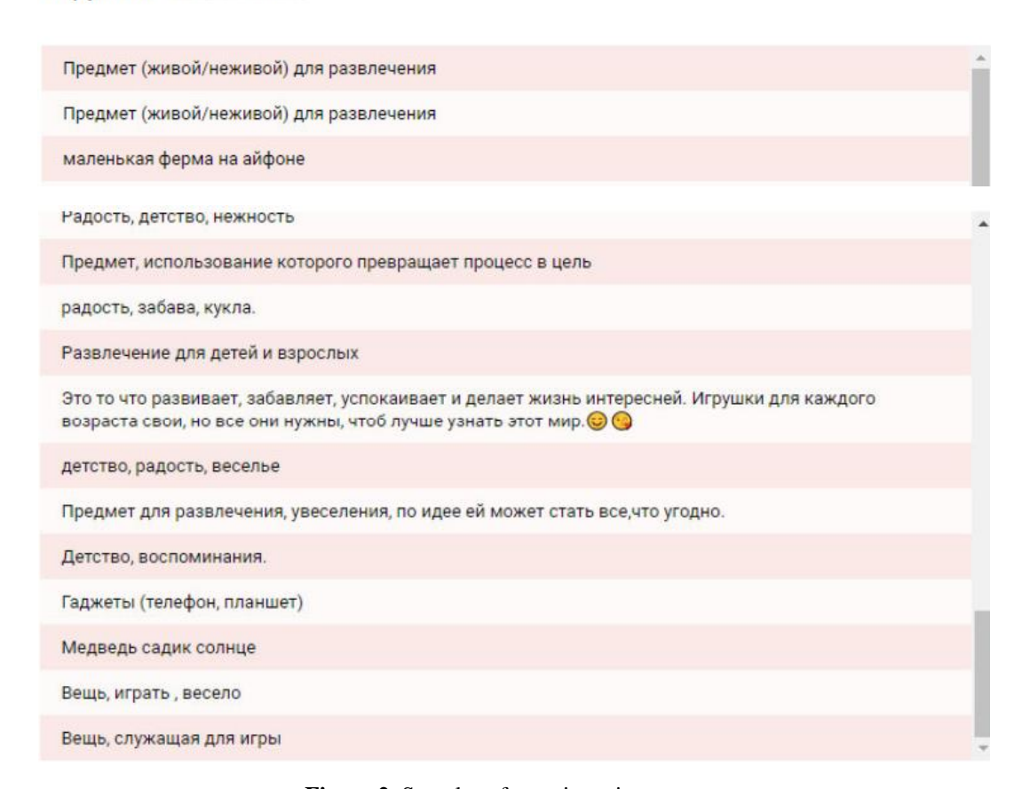
Figure 2. Samples of questionnaire answers