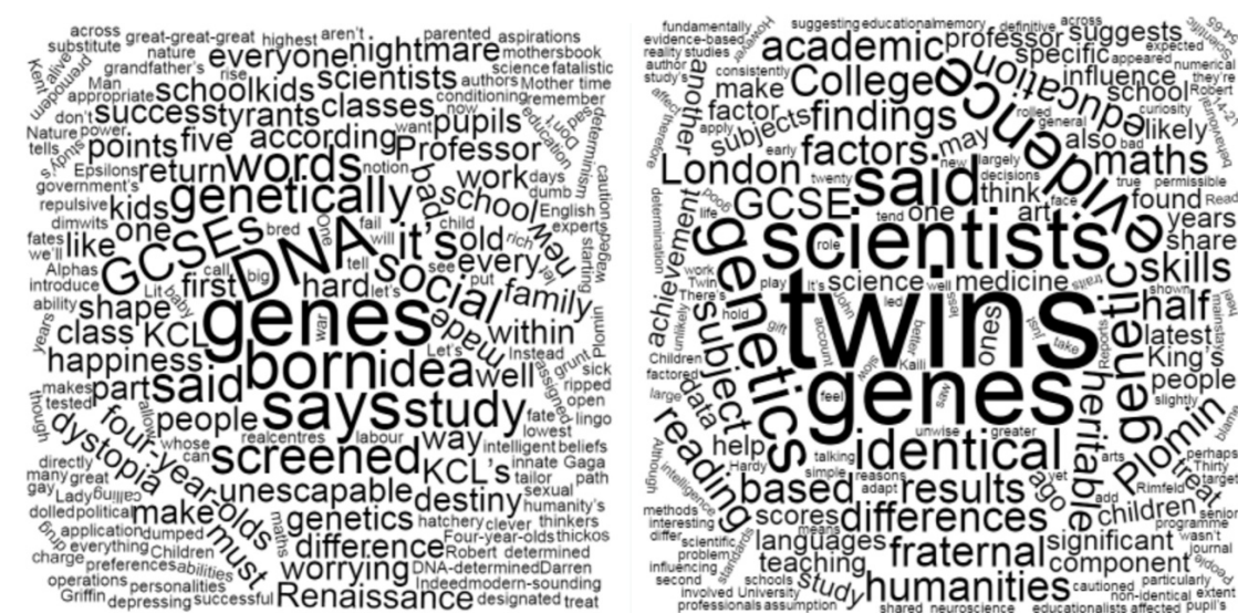
Figure 03. Word clouds for the high determinism (Left: Telegraph) and low determinism (Right: Guardian) conditions.

The word clouds were created on www.wordclouds.com . From the Telegraph text, “Brave New World” was removed, as social familiarity may lead to response bias. As media framing requires a certain exposure time to be effective (Buturoiu and Corbu, 2015), each participant was presented with their word cloud for exactly 60 seconds.