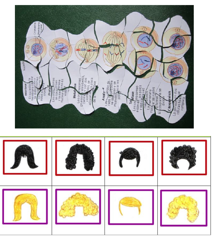
Figure 03. Materials for games related to biology topics, designed by a secondary teacher in training: mitosis puzzle and stickers with wigs for playing with genetics

Regarding the end-of-Master's teaching-proposal project, secondary teachers in training were able to design their own educational approaches based on playful learning for scientific education. They also prepared the materials needed to implement the proposal. An example can be seen in Figures 03 and 04.