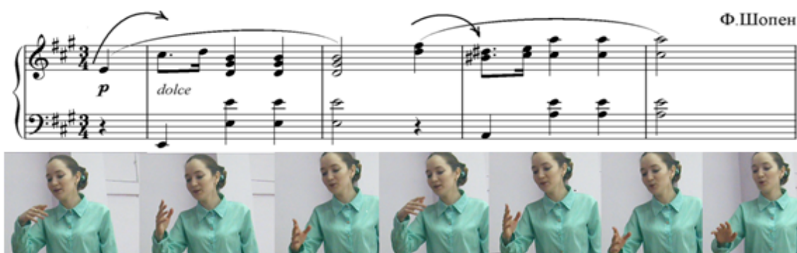
Figure 01. F. Chopin, Prelude 7.

Episode 1. In the work on the Prelude 7 of F. Chopin the expressive movement of the hand reveals the beauty and the airiness of the initial ascending intonation on the 6th interval: