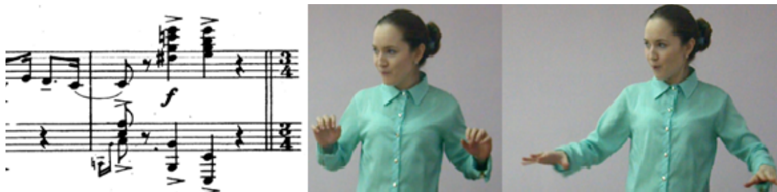
Figure 02. Prokofiev. Dance of the Knights (from the ballet "Romeo and Juliette")