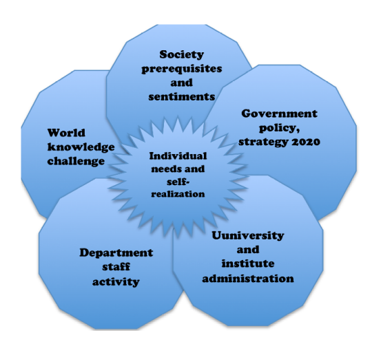
Figure 01. Science immersion environment

The Department of foreign languages in economics, business and finance, Kazan Federal University opts for engaging novice teachers into effective, ongoing professional learning to develop 'progressively higher levels of expertise' (Department of Education & Training, 2005).