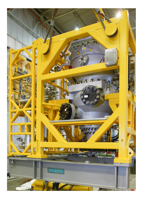
Fig. 4. SPC ECO-II Siemens.

Table 3 shows SPCs of different companies today, components and characteristics of electrical mechanical systems, their locations and experience of application.