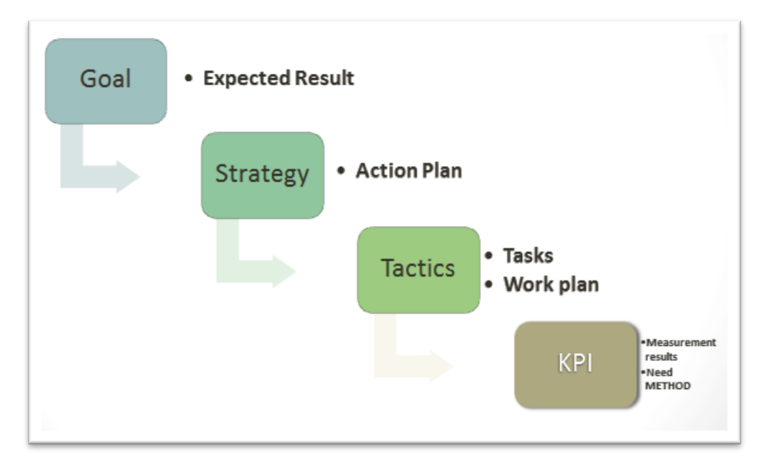
Fig. 1. KPI place in business process system

KPI's are a good alternative, reforming the business management system as a whole. KPI binding to the target wage level allows employees to express goals of the owner in a simple and understandable way - in salary (Srimannarayana, 2010). Enterprise Management System involves a chain of "goal-strategy-tactics-business processes." Levels can be both formal (typical for a company with a high level of internal organization), and formalized (Gabcanova, 2012). First, let us define the purpose of the enterprise. For example, the goal is to retain current position in the market. Then depending on the goals, the main directions of the goal (its strategy) are being outlined. According to the planned direction, a work plan is being developed - a tactical level of management. Further, at the operational level, the work plan is adopted by members of stuff to their work (Fig. 1).