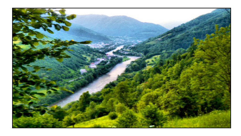
Fig. 1. Viseului Valey

Vegetation on the territory of Bistra is rich and very diverse, represented on altitude floors depending of several key factors, such as climate, soil, slopes, lithological substrate. For ecotourism, different plant species are natural attractions, interesting in that their ecosystems is untouched. Bistra hydrography is represented by two major rivers of Maramures Country, Viseu River and Tisa River each with its tributaries (see Viseu River in figure 1).