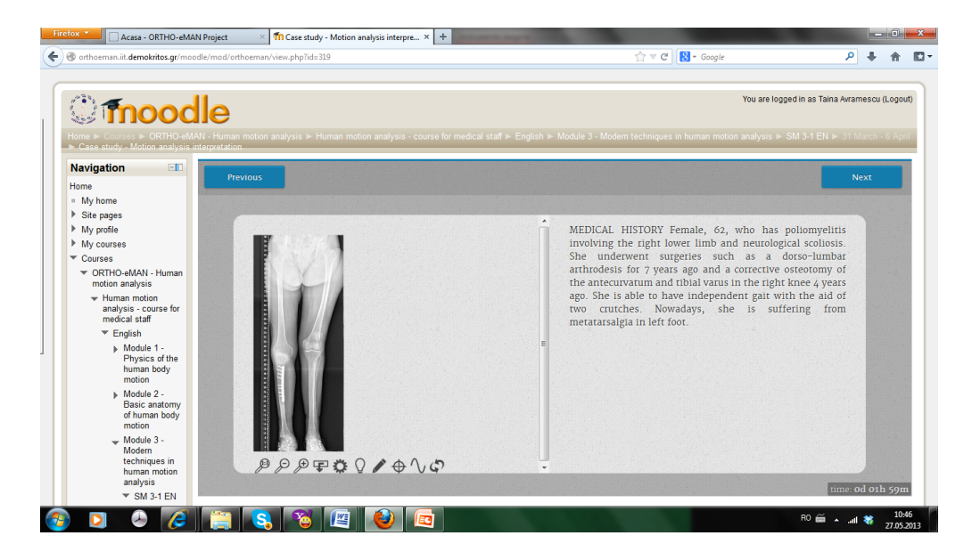
Fig. 3. An example of a case study development – clinical analysis

The case studies were developed in the ORTHO e-man project and COR-skills project and refer to clinical and imagistic evaluation of the patient and clinical gait analysis. Analysis was carried on before and after surgery and/or rehabilitation. The trainees can use platform specifications that allow comparison of recorded date before and after medical procedures. In Figure 3 is shown an example of case study development.