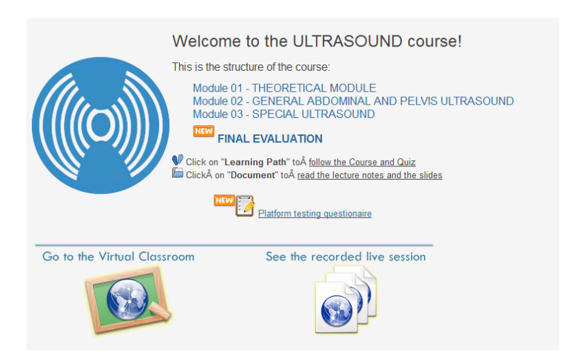
Fig. 2. Types of learning objects for the ultrasound training module