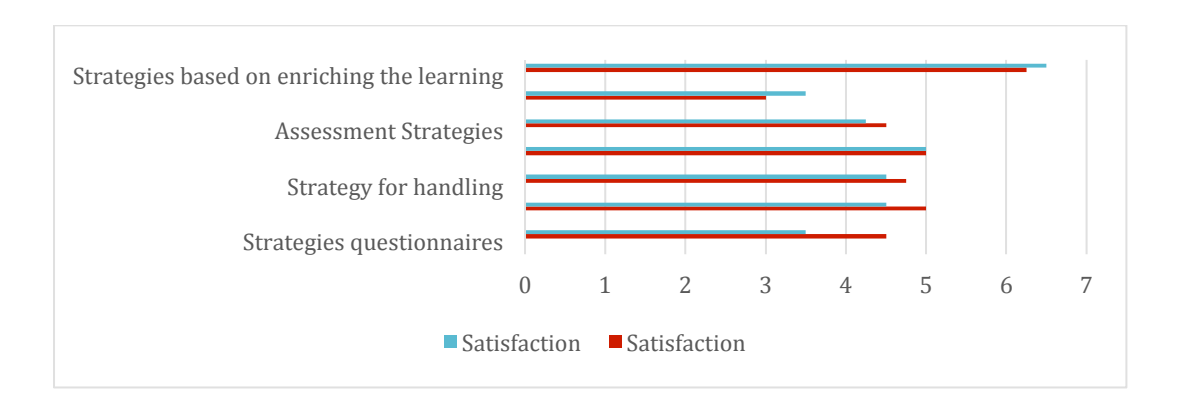
Fig.3. Distribution of scores on the satisfaction of the strategies used

The above figures show that all types of teaching strategies are found in experiential model pedagogy. This demonstrates once more the importance that teachers are aware of the importance of