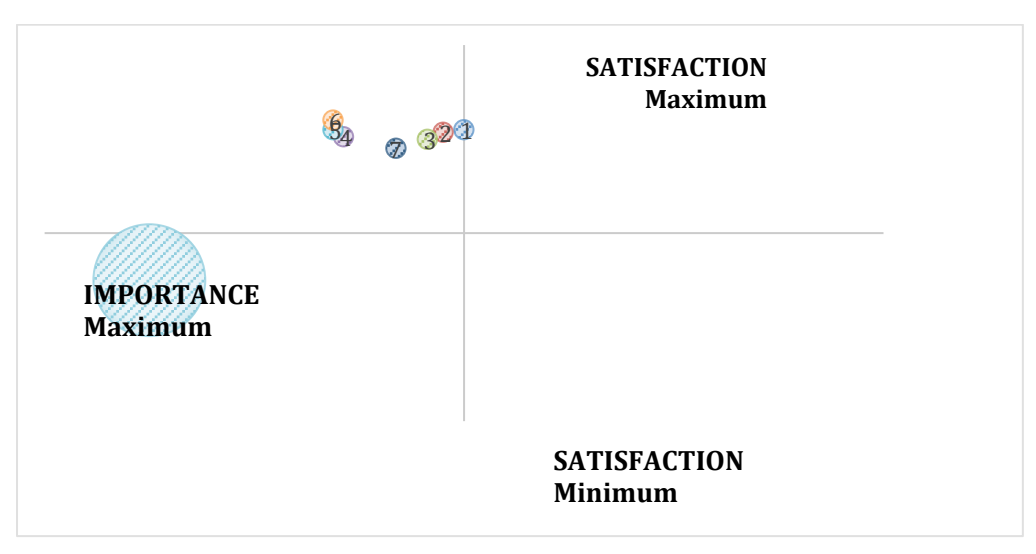
Fig. 4. Nice & Gaps two-dimensional matrix