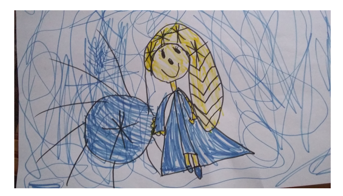
Fig. 2. The drawing of Elsa

From a psychological point of view, the key factors that are very persistent in these drawing, as we noticed, are power, magic and the ability to release something... fire or ice etc. The interpretation of the drawings does not make the objective of this paper, so we will not go into too much details and examination about them. Piaget (2005) explains that "magic" is the reproduction of symbolism of an action that resonates within itself and with the magical gesture from something given symbolically. In the Preoperational stage, semiotic functions are outline in the children's ability to engage in several different activities such as drawing and recall memory which are differentiated by signifier systems and in turn are