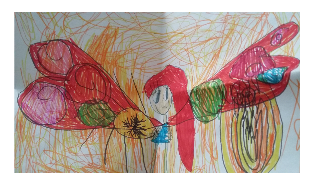
Fig. 1. The drawing of Winx