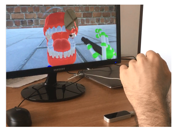
Fig. 4. LMC used for VR training in dentistry

feedback, like drilling or cutting. There are still several operations that can be practiced and improved in VR, like visualization, choosing the right treatment, making the resins, etc. In Fig. 4 there is shown an application that challenges the student to discover caries using a mouth mirror. The code is developed in Unity.