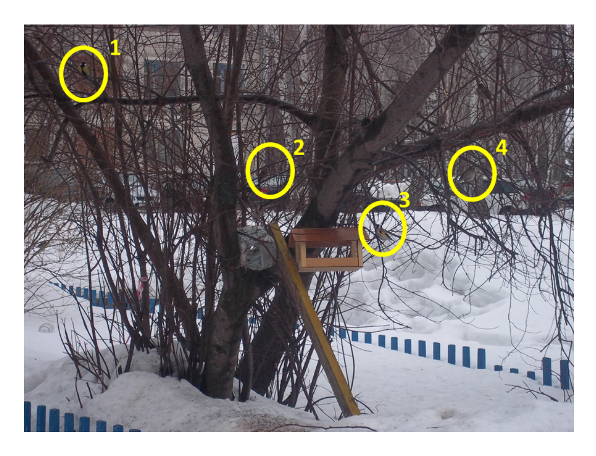
Fig. 2. The fragment of the multispecific gatherings of birds around the feeder: 1 - great tit, 2 - field sparrow, 3 - goldfinch 4 - house sparrow.

Among the winter ornithological population of airport "Tomsk" not all species of birds are attracted by feeders some species prefer to use alternative feed. These birds most often is present at the airfield when searching food and stay for a long time near the runway or even on it, constantly moving and thereby creating a potentially dangerous situation for the aircraft. Thus the biggest occurrence of mealy redpoll and snow bunting were observed in the vicinity of the runway on the vast meadow areas where these species examined stand of grass sticking out of the snow while searching the seeds. On the territory of the village these species are not encountered. A similar pattern of occurrence was observed in crow who hunted on the airfield runway exclusively near the airfield or crossing it flying over. All crows met at the airfield were also on the runway or flying over it. Black cock is avoided by the man and during the winter period is held in the part of the airfield where it grows birch undergrowth, forming gatherings of up to 6 individuals and periodically crossing the airfield through the airfield. There were no such species as parrot crossbill and nutcracker near the feeders that due to the specifics of the feeding diet do not use feeders. These two species were encountered only in the territory of the airfield however they were only on its peripheral part in a forested area posed no hazard to the AV.